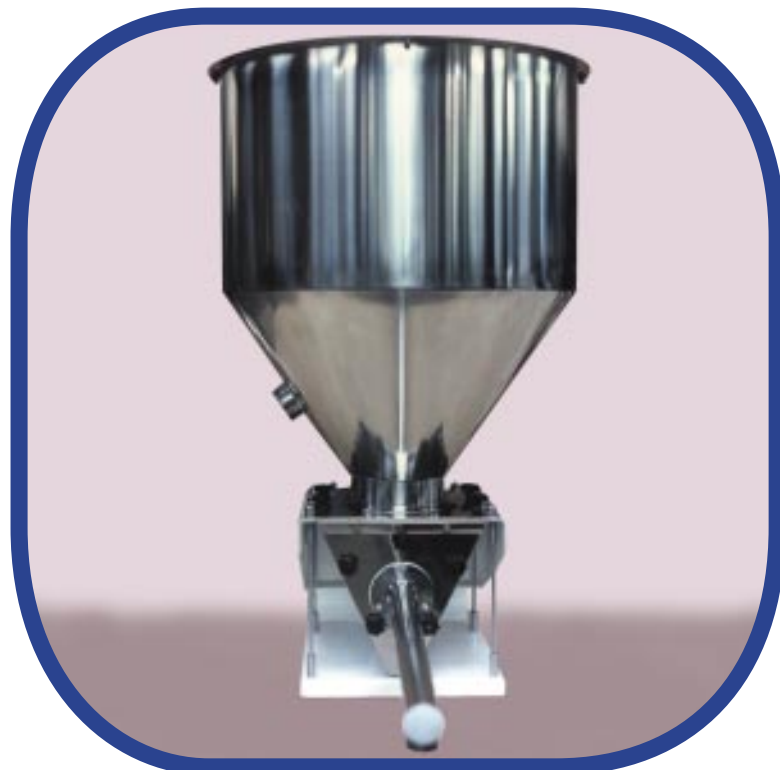
Special Designs for Specific Needs