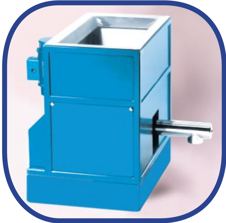
General Purpose Model with Vibratory Conditioning