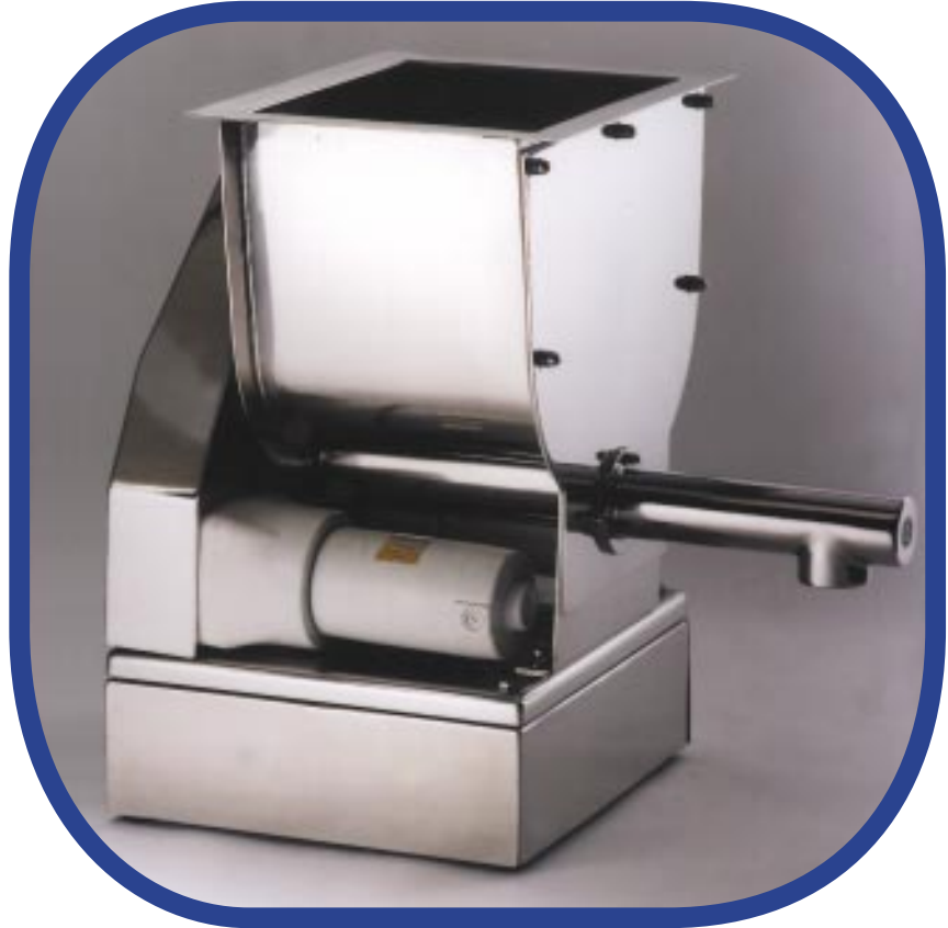
Sanitary Model with Agitator Conditioning

Designed to operate in a wide variety of different environments, the Rite Weight™ feeder can be built into most handling systems. It is fully compatible with the existing Soliweigh MK1 & MK2 systems as well as the Solifeeder range of Volumetric Feeders.